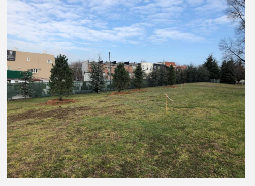
Young trees planted at the main Bushwick Avenue entrance