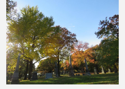
Trees grace the Cemetery's grounds in all seasons.