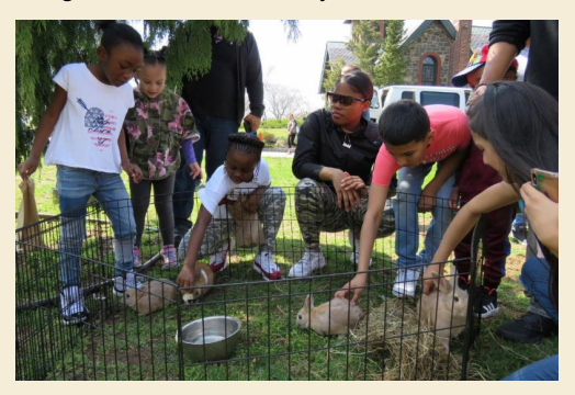
We would like to thank Carbone Memorials Inc for sponsoring this event.

On Saturday April 13, 2019 we welcomed over 300 members of the community for our Third Annual Easter Eggstavaganza. Participants enjoyed an egg hunt, a visit from the Easter Bunny, a magic show, and petting zoo all on the beautiful grounds of the Evergreens Cemetery. The event was free and open to the public and a good time was had by all.